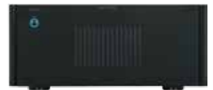
RMB-1555 Multichannel Power Amplifier